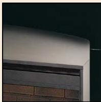
Stainless steel surround