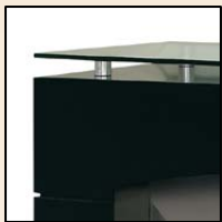
Elevated glass top

Striking, bold and contemporary describes this elegant fireplace featuring strong, simple lines accentuated by a stainless steel surround and elevated glass top.