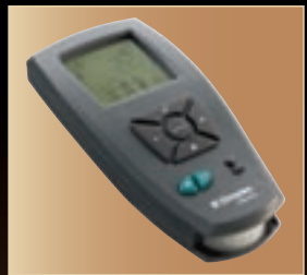
Deluxe remote control